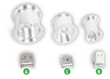
CAPSTAN DRUMS, INCLUDING ROPE GUIDE

FOR PCW5000 A. PCA-1100 - 85 mm B. PCA-1110 - 57 mm