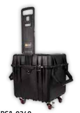
PCA-0340 Waterproof and airtight case with removable casters and folding top handle for winches and accessories.

No matter where you need to bring your winch, it will be easily carried and protected in one of our transport options. You can even carry the PCW3000 on your back, thanks to the molded backpack.