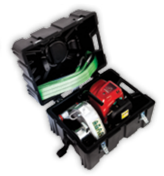
PCA-0102 Purpose built transport case with molded locations for the PCW3000 and accessories. Fits molded backpack PCA-0104.