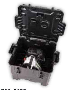
PCA-0100 Purpose built transport case with molded locations for the PCW5000 and many accessories.