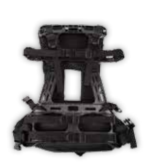
PCA-0104 Molded backpack for Transport Case PCA-0102 and Rope Bag PCA-0103 or XXL Extra Large Transport Bag PCA-0105.