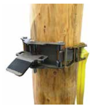
Winch anchor system for trees and poles with 3 m strap.